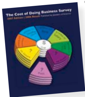
Participants will receive a free copy of the Cost of Doing Business Survey (above).